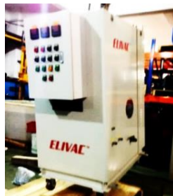
Mobile transformer service