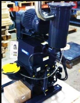
ETC190/ETC112 Two stage