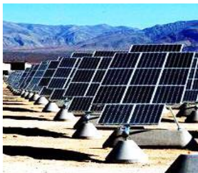
Silicon growing for solar panels

ELIVAC piston pump is widely used in the solar, battery, electronic , coating, degassing, packaging , chemical and more industries. It makes perfect match with ELIVAC roots pumps for larger capacity and higher vacuum.