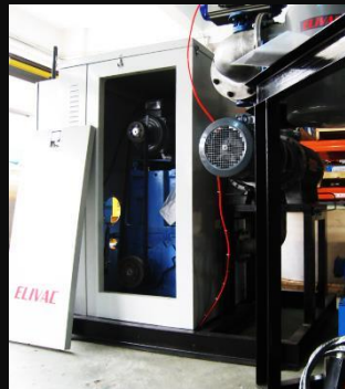
ET500+ER4300 VFM degassing