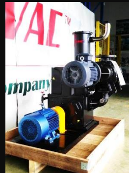
ELIVAC Patent DDM Pump