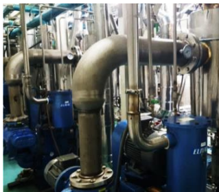
Piston-roots system for oil process

Option: Variety vacuum oils for different application; direct drive VF motor without belt set; cooling water accessories; additional cooling coil or heater; system integration, etc. contact ELIVAC engineers for details.