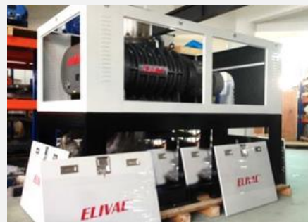
ELIVAC Factory in China

An International Brand with Proven Swiss Quality