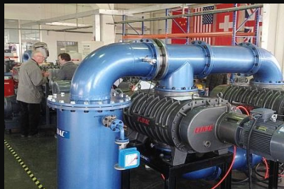
Steel degassing, coating & furnace