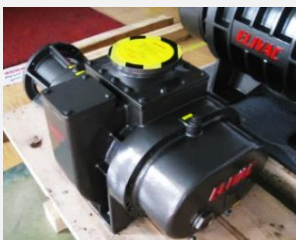
ERB2200/3300AMC Mechanical by-pass