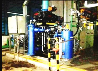
Power plant energy savings