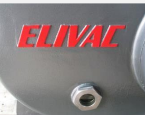
High temperature painting