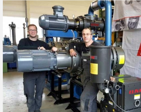
ELIVAC SWISS GmbH in Switzerland

There is no “one size fits all” Roots pump! This is true not only what pumping speed is concerned but also to applications, work conditions and system set up.