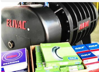
NSK bearings and SKF seals as standard