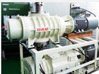
ER4300/5100AMCCOIL 5-Point mechanical seal