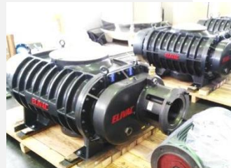
ER25000 Dust seal