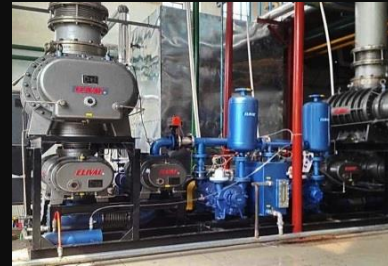
Edible oil process